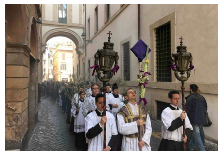
Folded chasuble, FSSP

Thus we find, in what was officially described as the 'Restored Holy Week' of 1955, entirely new elements such as the recitation of the Pater Noster in unison, in the vernacular, on Good Friday, and the 'renewal of baptismal promises' during the Easter Vigil. Many genuinely ancient features, on the other hand, were lost, such as the use of folded chasubles, a very ancient feature of the Roman Rite on penitential days.