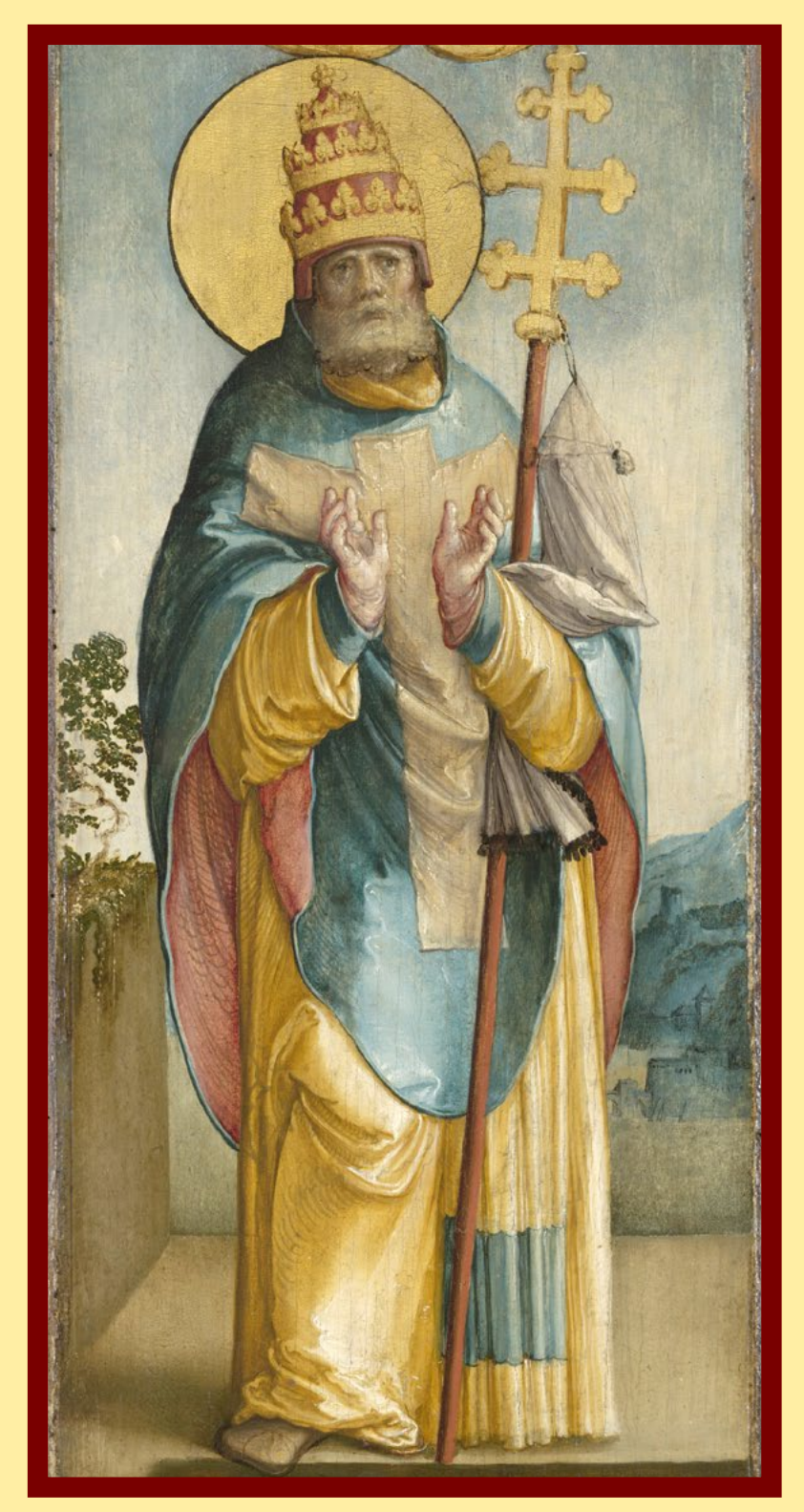
"He who would climb to a lofty height must go by steps, not leaps." - St Gregory the Great