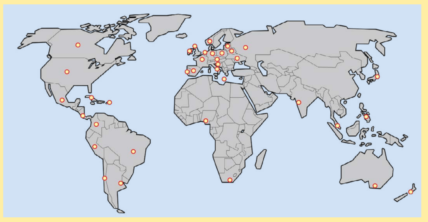
Hover the mouse pointer over the yellow circles to see the local Una Voce Member Association(s).