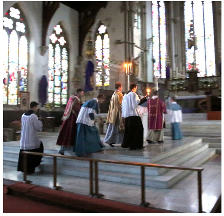
Triple Reed, ICKSP: St Walburge's, Preston, England (Easter Vigil 2018)

Before 1955 the Holy Fire was not used to light the Paschal Candle directly, since the latter was immovably situated in the sanctuary of the church. Instead, it was used to light a 'reed' with three candles, and it was this reed which was carried into the church. The Exsultet then functioned as the blessing of the Paschal candle. The extraordinary changes to this part of the rite were justified in part by claims about ancient practice which have been shown, since the 1950s, to be false.